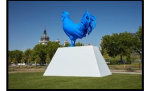
Katharina Fritsch, Hahn/Cock, 2015

$10.00 per person (tax-deductible donation benefiting BOND'S Scholarship Fund)